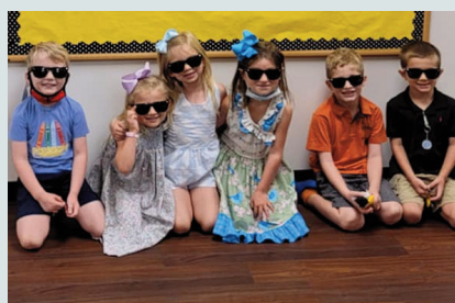
Our kids showing it's "cool to be in Sunday School!" on promotion Sunday, August 15. Below: praying for children, teachers, and school administrators