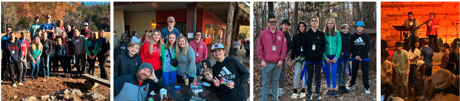
Above: Youth and adult volunteers participating in activities during Refuge Shepherd of the Ozarks November 10-12.