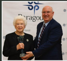
Community Spotlights PAGE 6