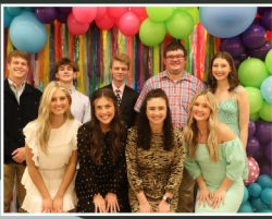
Our high school seniors PAGE 3