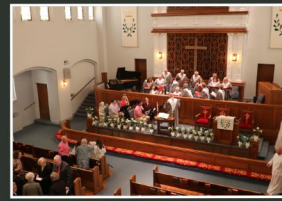
Holy Week/Easter PAGE 7

Love God. Serve People. Make a Difference.