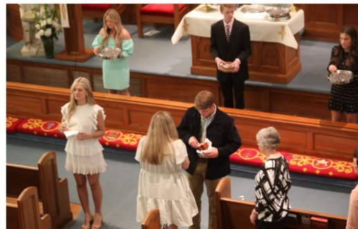
Scenes from Senior Sunday, May 1: contemporary service, brunch, and leading the traditional service