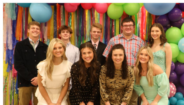
Group photo taken on Senior Sunday