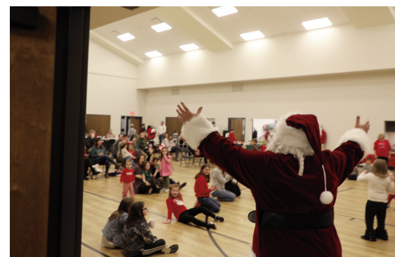
After the children’s Christmas pageant, the Kinders musical duo gave a concert, and then Santa came to visit!