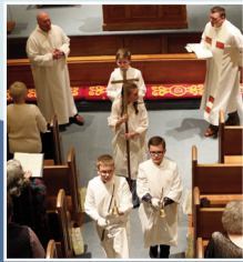
Christmas Eve Services PAGE 3