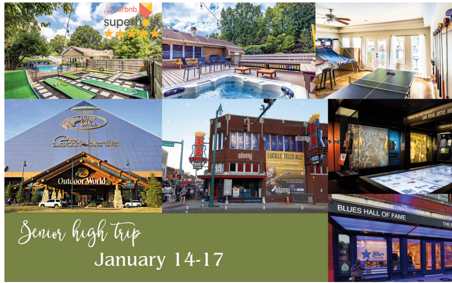
Remember our youth as they head to Memphis, TN for a trip January 14-17!