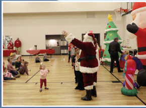
Children's Activities PAGE 2