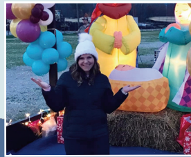
Volunteer Spotlight PAGE 4

Love God. Serve People. Make a Difference.