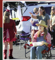
Trunk or Treat PAGE 3