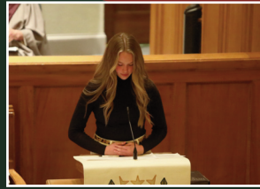
Hanging of the Greens PAGE 2