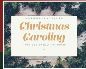
December Calendar PAGE 5

Love God. Serve People. Make a Difference.