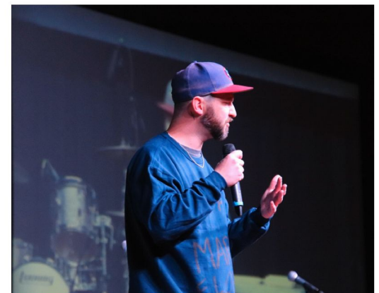
Scenes from Veritas in March. Veritas is an annual event that is youth-focused and features worship music, speaking, and testimonies.