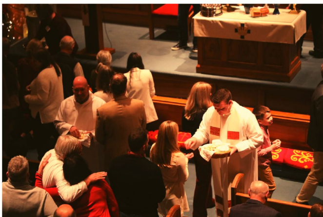
Christmas Eve Communion 2021

On Sunday, May 8 worshippers will make their Next 100 Years Campaign commitments. For some, this new commitment will be continuing or restarting of More Than Bricks commitments. Others will make new or larger commitments. For some worshippers this will be their first time to participate in a capital campaign. Commitments are 5 years in length beginning June 2022. We believe this will lead us to having our debts nearly paid off by our 2026 centennial celebration.